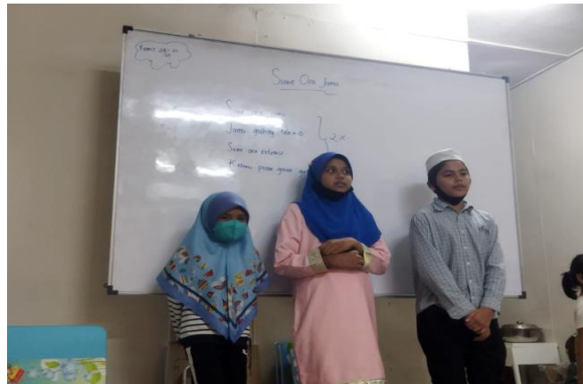
Figure 4. Singing the national anthem

Students at SB Sentul have religious inculcation from an early age where they learn religion not only at school but also through formal institutions, one of which is that they attend school in the afternoon just to study and deepen religious knowledge. And also this spiritual cultivation is not only in formal and non-formal institutions but also starts from the family environment where from an early age they have been equipped with religious knowledge by their parents. This is very visible when we carry out one of our routine activities, namely reading prayers together before starting lessons, carrying out dhuha prayers together before learning begins, and of course being on time when the prayer schedule is held. They did not hesitate at all in praying and memorized the prayer well. Apart from that every Friday we also carry out reading the Koran in congregation and when we finish the prayer we appoint one of the students to lead his friends in prayer and he memorizes the prayer very well even though they are still relatively young but with the cultivation of religious knowledge from their parents, they were able to memorize the prayer.