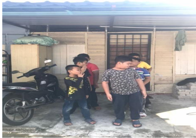
Figure 2. Sports Activities

This activity aims to keep the bodies of students at SB Sentul healthy physically and spiritually. The exercise is carried out every Friday morning, even though SB Sentul itself does not have an adequate field to carry out sports activities, there are still other alternatives to carry out activities. gymnastics is like a field. This Ceria Gymnastics activity is one of the work programs that we carry out which aims to keep the bodies of Sentul SB students healthy physically and mentally, while this activity is carried out on Fridays. Of course, the students are very enthusiastic about the work program that we carry out and the hope is that this program will always continue to be used in their daily life so that they can get real benefits. Healthy life skills education is basically the cultivation of habits that include physical health in the form of a level of physical fitness, mental and social health. The existence of the motto "Mens sana in corpore sano" which is the life motto of the Romans gives the impression that a healthy body is considered a presupposition or Sine Quomom Condition, which is in the form of "perfect human being", related to two elements that in a healthy body there is a healthy soul too (Indrayogi, 2020)