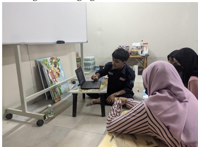
Figure 5. is showing the territory of Indonesia through animation

Growing regional traditional cultural arts can be done by way transfer of regeneration cultural values to the next generation (Utomo, et al. 2020).The introduction of culture is carried