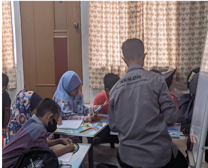
Figure 1. Preliminary Observations

(Anjarwati, Pratiwi, and Rizaldy 2021). During the pandemic, literacy culture has decreased (Ningrum et al., 2021).