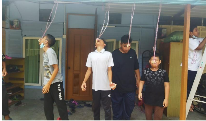
Figure 6. Activity 17's

out through various media, as shown in Figure 4 which shows the children coming forward to sing national and regional songs. As well as introducing the territory of Indonesia because some children have never been to Indonesia as shown in figure 5.