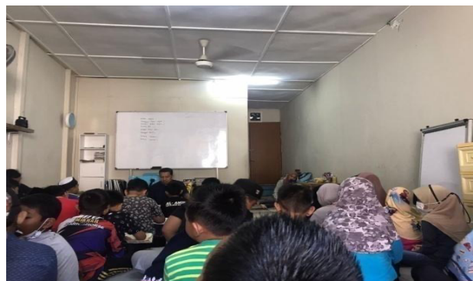
Figure 3. Group recitation activities

This activity aims to keep the bodies of students at SB Sentul healthy physically and spiritually. The exercise is carried out every Friday morning, even though SB Sentul itself does not have an adequate field to carry out sports activities, there are still other alternatives to carry out activities. gymnastics is like a field. This Ceria Gymnastics activity is one of the work programs that we carry out which aims to keep the bodies of Sentul SB students healthy physically and mentally, while this activity is carried out on Fridays. Of course, the students are very enthusiastic about the work program that we carry out and the hope is that this program will always continue to be used in their daily life so that they can get real benefits. Healthy life skills education is basically the cultivation of habits that include physical health in the form of a level of physical fitness, mental and social health. The existence of the motto "Mens sana in corpore sano" which is the life motto of the Romans gives the impression that a healthy body is considered a presupposition or Sine Quomom Condition, which is in the form of "perfect human being", related to two elements that in a healthy body there is a healthy soul too (Indrayogi, 2020)